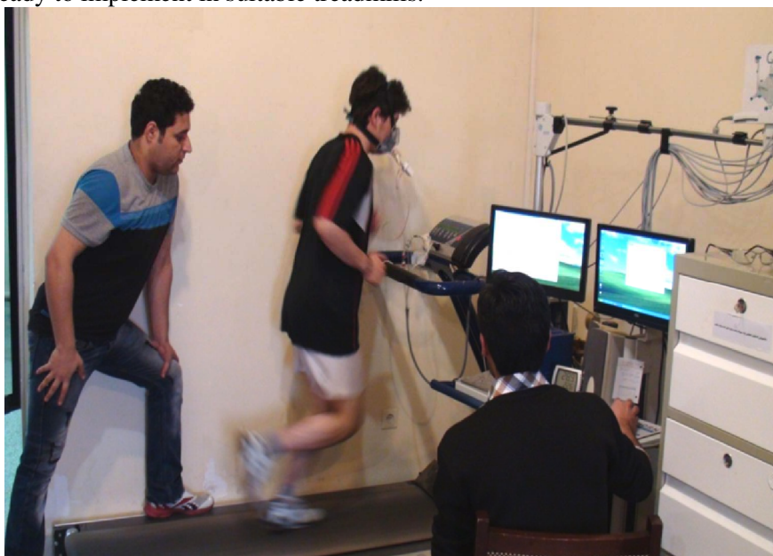
Figure1. Validity and reliability testing.

The outcomes of this project was a simple and reliable method in estimation of anaerobic threshold and develop a training method by using a treadmill and design a software to implement the assessment technique of anaerobic threshold as well as software facilities for daily training. Using treadmill and cycle ergometers are the best method for control training but choosing best training intensity is crucial. According to one decade of our research experiences, it is possible to determine optimum personal training intensity based on person's anaerobic threshold. In this method, hear rate is used to draw heart rate-time curve during a graded maximal intensity exercise to find the best treadmill speed and slope in his/her anaerobic threshold and follow specific treadmill training every day. The software and hardware is implemented in an embedded system and it is ready to implement in suitable treadmills.